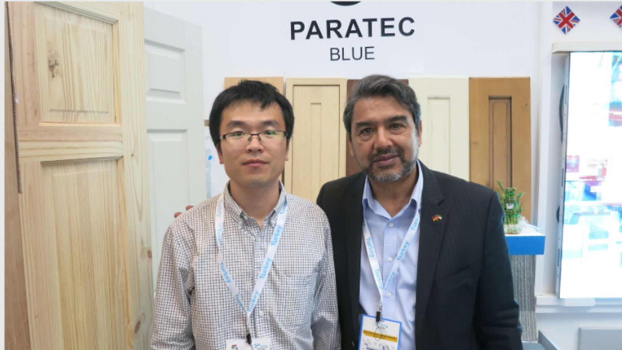
Invited by exporter from UK