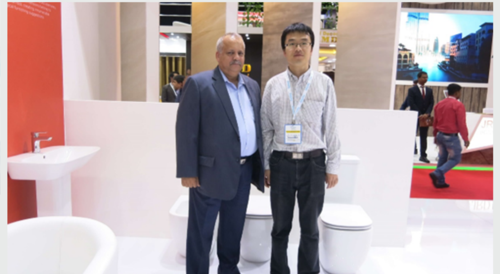
Business Meeting with Supplier from UAE