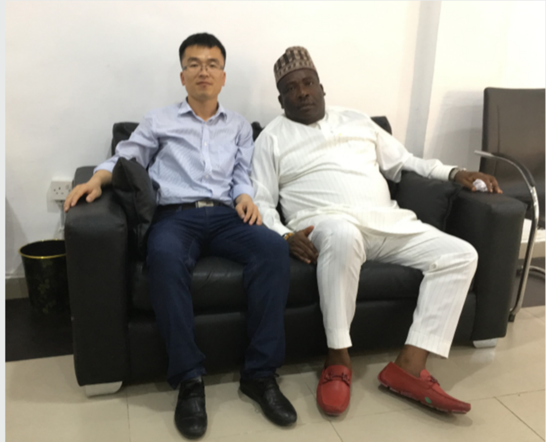
Together with African entrepreneur