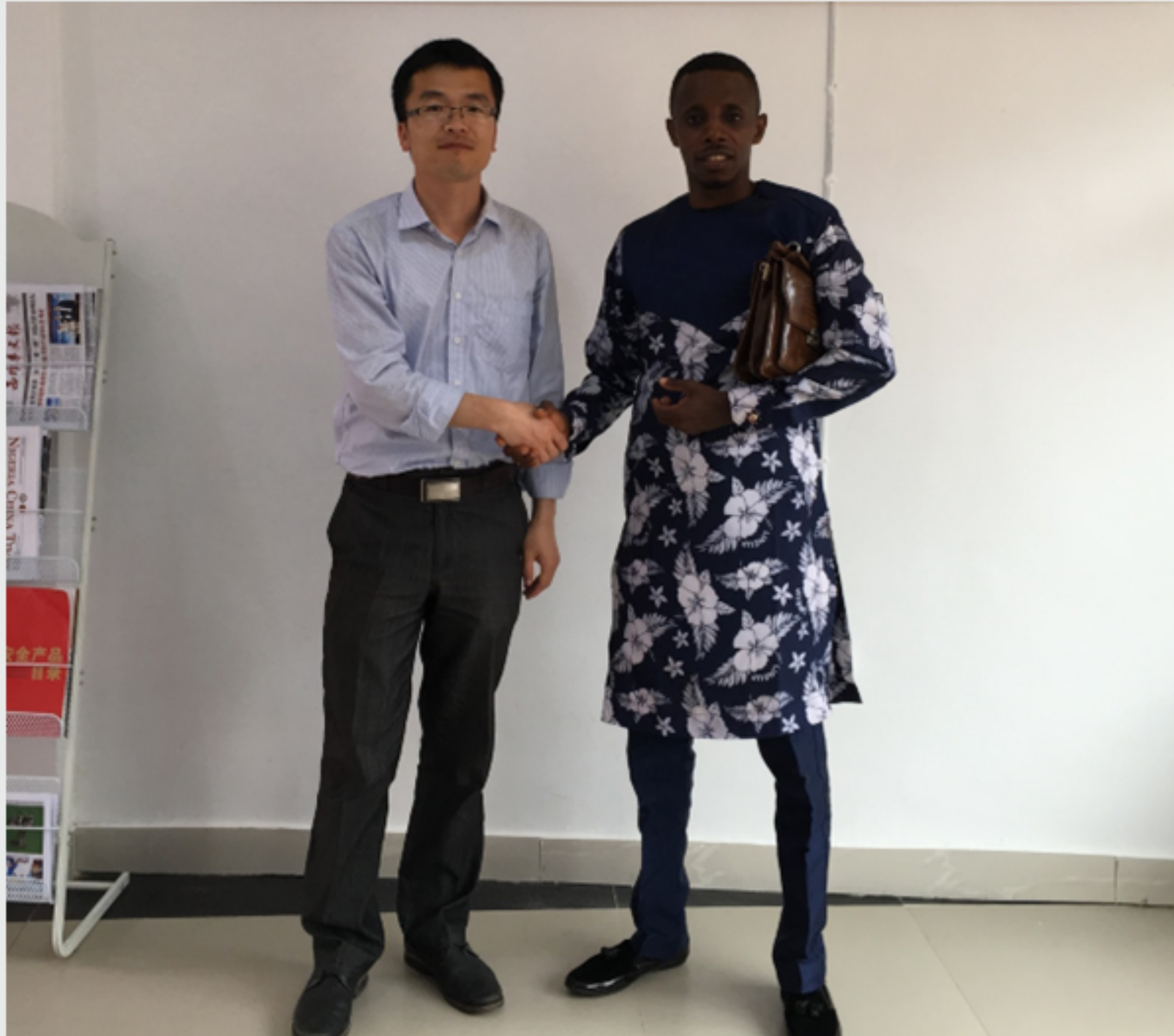
Sign agreement with Nigeria country partner